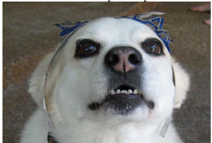
Are We Finished Yet?