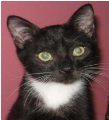
At Four Months

Cathy, thrown from a vehicle, rescued and brought to VSA last fall, is now a happy, healthy kitten ready for adoption.