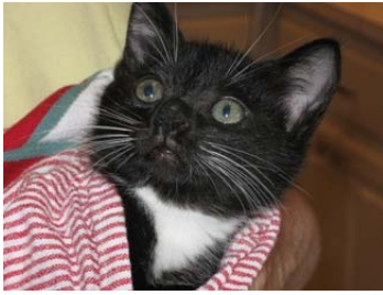
Just After Rescue