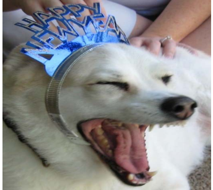
I'm Sleepy--Partied Too Much